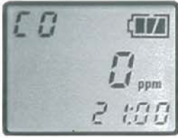
Measuring display for CO