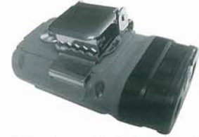
Alligator clip (Standard)