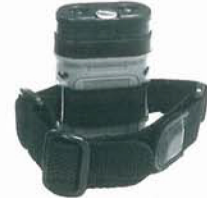
Arm band (Optional)