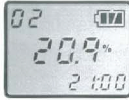
Measuring display for O 2