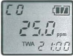
TWA indication for CO